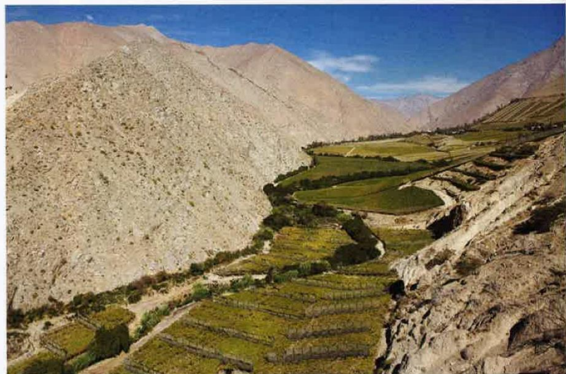
The Elqui Valley in northern Chile is one of the country's leading sources for Syrah and Sauvignon Blanc.

Many of Chile's current releases hail from the 2015 vintage, which ranks as one of the country's best in recent memory. The vintage came as a welcome relief for vintners amid a series of challenging harvests that have been quite anomalous in the